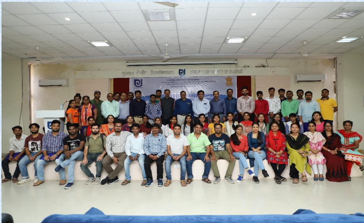
Group photo of participants with resource persons and members of School of Education