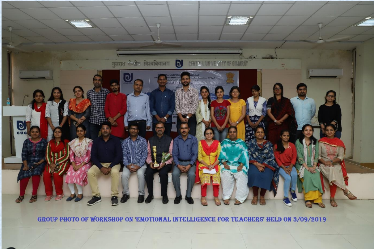
GROUP PHOTO OF WORKSHOP ON 'EMOTIONAL INTELLIGENCE FOR TEACHERS' HELD ON 3/09/2019