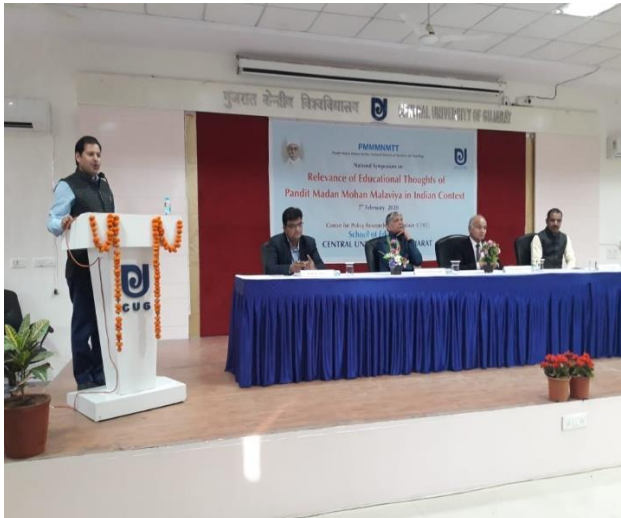
Participants sharing their Memories of the symposium