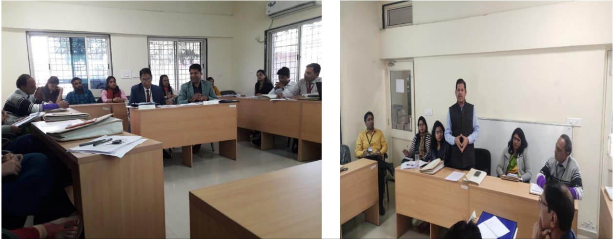
Participants presenting their views on PMMM and his contribution to society and Indian Education System during Round Table 2C.

was PMMM and his contributions to Society and Indian Education System. Each participant was given 5-7 minutes for the discussion and presentation.