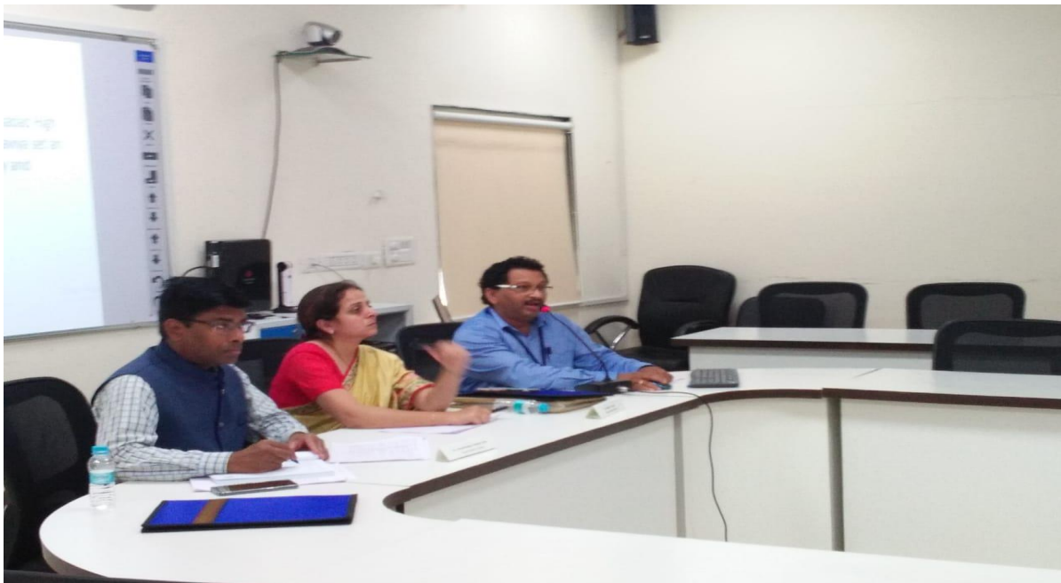
Discussion During Round Table 2D