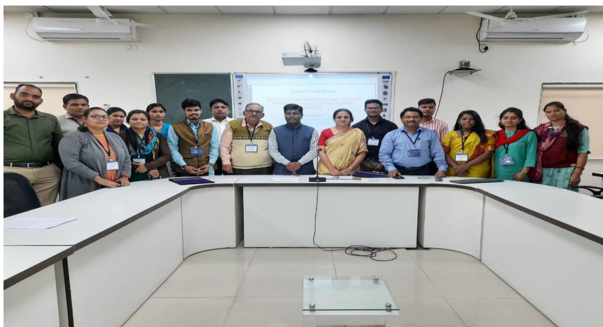
Group Photograph of Round Table 2D