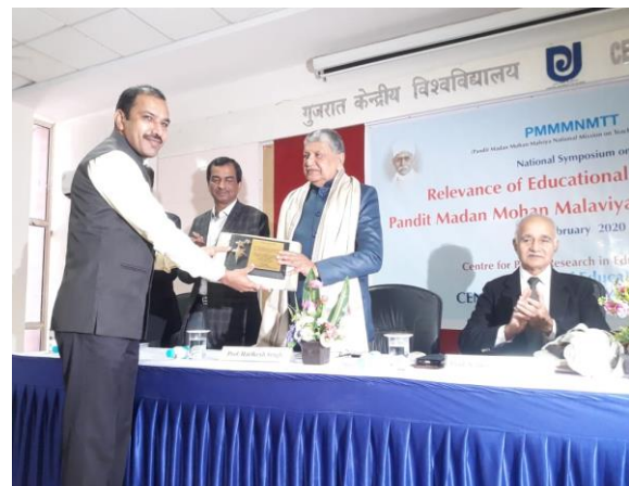
Angvastram Welcome of all the guests of the National Symposium