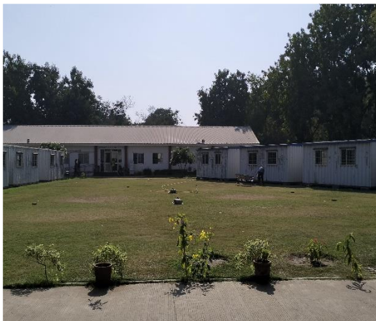
Lush green campus