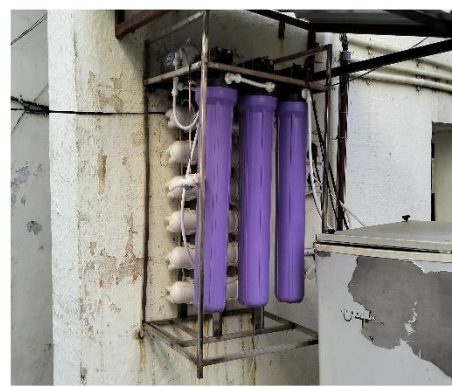
Water purifier installed