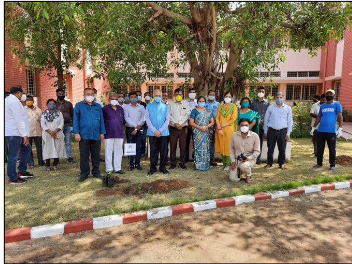
Tree plantation - CUG Sec 29 campus (5th June 2021)