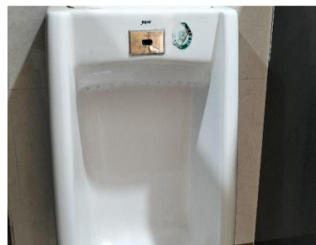
Sensor based urinals to save water