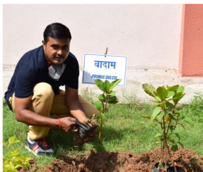
Plantation on World Environment Day