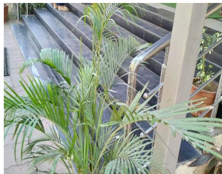
Indoor Plants in the campus