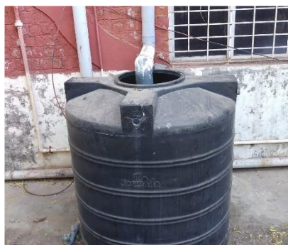
Rainwater storage tank