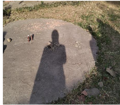
Rainwater storage tank