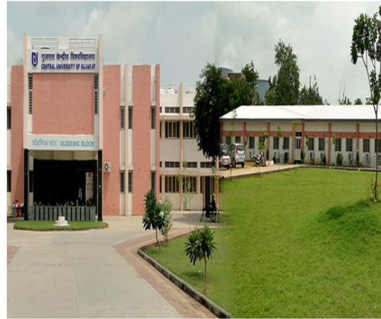
Well maintained University campus