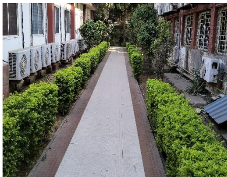
Ornamental Plants in the campus