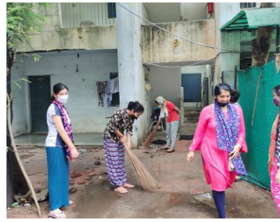
Cleaning in hostel campus