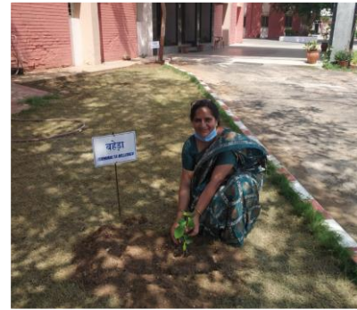
Plantation by faculty