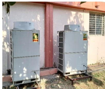
HVAC AC unit