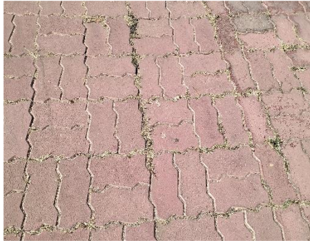
Paving stone installation in the university