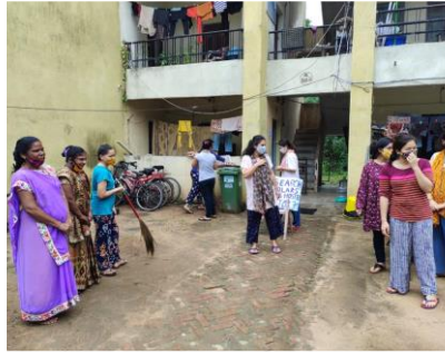
Cleanliness drive by girls hostel team