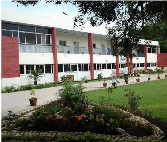
Well ventilated building structure