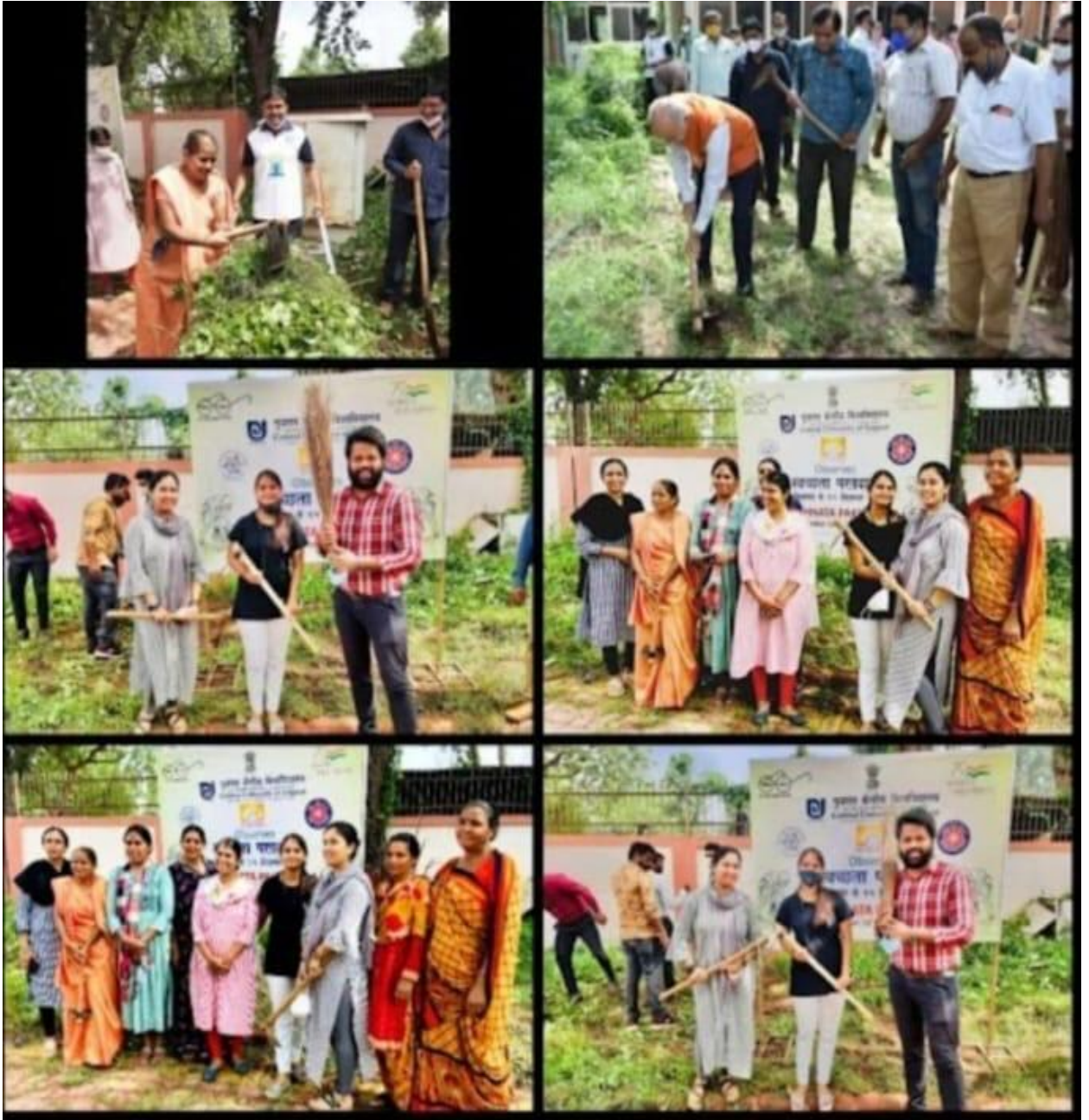
Cleanliness Drive by Faculty Members and Students on the Campus)