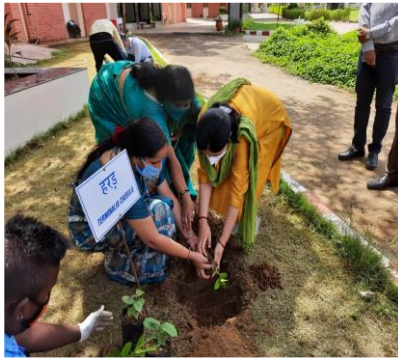
Herbal tree plantataion