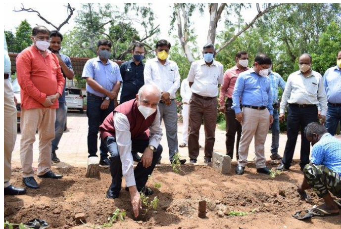
Tulsi Van" initiated at CUG (25th June 2021)