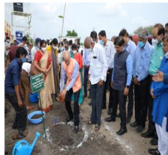
Plantation by senior officials