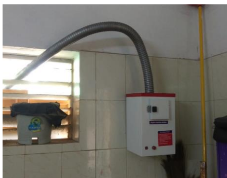
Incinerator for sanitary waste management