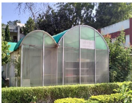
Green house nursery