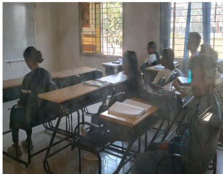
Classrooms as per NBC guidelines with more than 40% window ratio