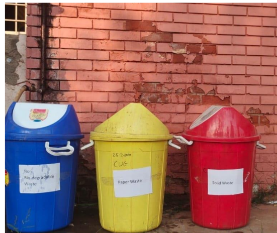
Color coded dustbins