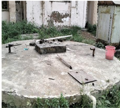
Underground water storage tank